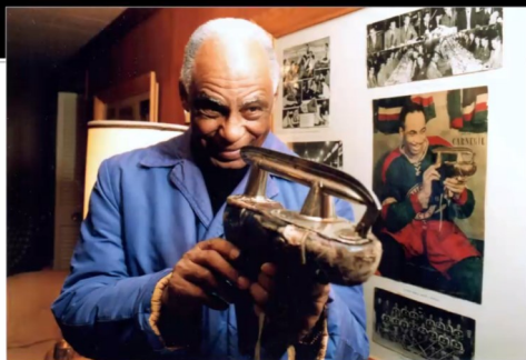
scoring in life – a diversity change agent