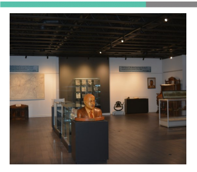
Permanent Gallery Is Open!