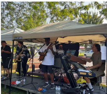
Emancipation Celebration Recap!