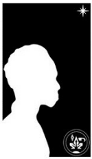
Photo Recap of Ribs and Ragtime!