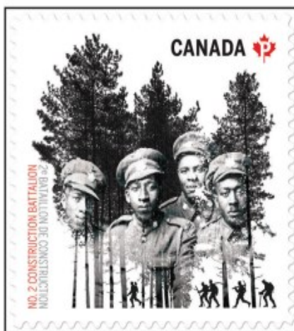
Canada Post issued this commemorative stamp on January 14, 2016 in recognition of Black Canadian Veterans who served with No. 2 Construction Battalion in WWI. The stamp features an archival photograph of some of the unit's members against a backdrop of tall conifers.

When U.S. President James Madison signed a declaration of war against Great Britain on June 12, 1812, Black Canadians took the fight to the enemy alongside British