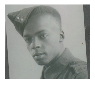
Honouring Those Who Served